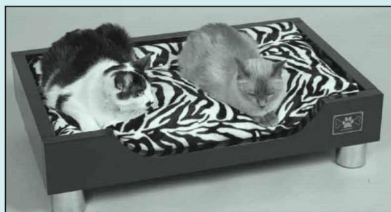
All the test cats enjoyed napping in the Lazy Bonezz cat bed that earned a four-paw approval rating.